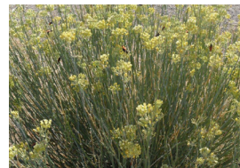
Rush Milkweed Asclepias subulata Desert areas.