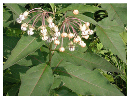
Poke Milkweed Asclepias exaltata Woodland areas (except in NE, KS, MO, ND & SD).