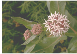
Showy Milkweed Asclepias speciosa Savannahs and prairies.