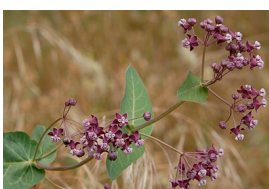
Heartleaf Milkweed Asclepias cordifolia Rocky slopes.