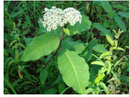
White Milkweed Asclepias variegata Thickets and Woodlands.