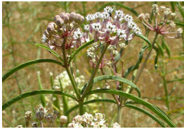
Mexican Whorled Milkweed Asclepias fascicularis Dry climates and plains, except in CO, UT, NM & AZ.

NOTE: Excludes Arizona; see below for Arizona milkweed.