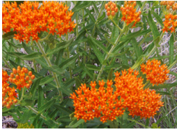
Butterfly Weed Asclepias tuberosa Well drained soils.