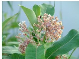
Common Milkweed Asclepias syriaca Well drained soils.