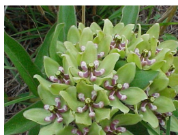
Green Antelopehorn Milkweed Asclepias viridis Dry areas and prairies. Also known as green milkweed.