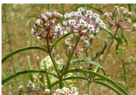
Mexican Whorled Milkweed Asclepias fascicularis Dry climates and plains.