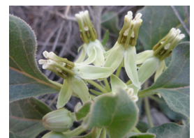
Zizotes Milkweed Asclepias oenotheroides Sandy/rocky prairies and fields.