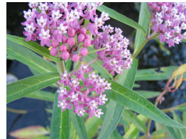
Swamp Milkweed Asclepias incarnata Damp, marshy areas.