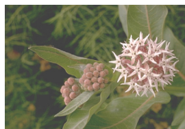
Showy Milkweed Asclepias speciosa Savannahs and prairies.