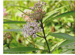
Aquatic Milkweed Asclepias perennis Hydrated soils.