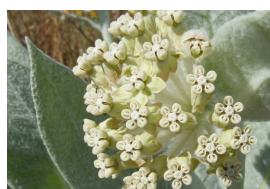
Woolly Milkweed Asclepias vestita Dry deserts and plains.