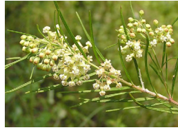
Whorled Milkweed Asclepias verticillata Prairies and open areas.