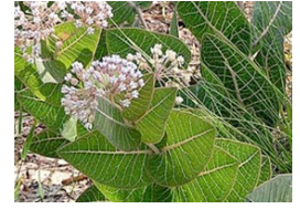
Sandhill/Pinewoods Milkweed Asclepias humistrata For use in some regions of FL. Dry sandy areas and soils.