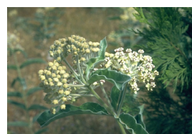
Woolly Pod Milkweed Asclepias eriocarpa Clay soils and dry areas.