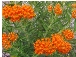
Butterfly Weed Asclepias tuberosa Well drained soils.