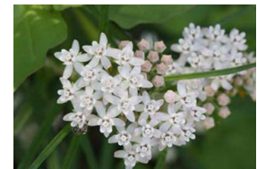
Arizona Milkweed Asclepias angustifolia Riparian areas and canyons.