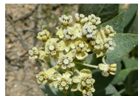
Desert Milkweed Asclepias erosa Desert regions.