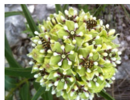
Antelopehorns Milkweed Asclepias asperula Desert and sandy areas.