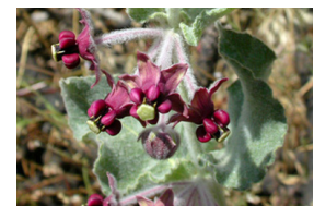
California Milkweed Asclepias californica Grassy areas.