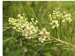
Whorled Milkweed Asclepias verticillata Prairies and open areas.