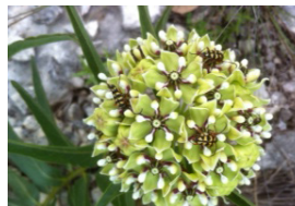
Antelopehorns Milkweed Asclepias asperula Desert and sandy areas.